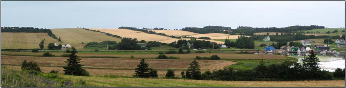
Fields like a patchwork quilt spread over the gently rolling countryside