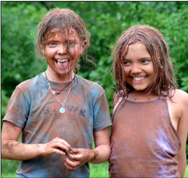
EmmyLou Harris’s “Red Dirt Girls”

In summer on PEI, green fields criss-crossed by red clay lanes and outlined by spruce hedgerows look like a patchwork quilt. As autumn approaches and fields turn shades of gold, they contrast even more sharply with the pink sand of Island beaches and the blue of sea and sky. It takes poetry, not a cycling guide, to capture the special quality of PEI’s light and landscape, but ride here for a while and you will know why many people have called it the most beautiful place on earth.