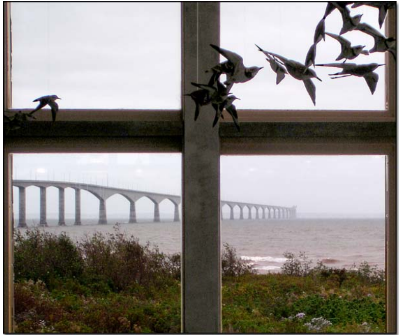
Confederation Bridge from New Brunswick to Prince Edward Island

Now Confederation Bridge is a reality, though some Islanders insist on calling it a "fixed link." It took 5000 workers almost four years to finish the 13-kilometer span, which was built on 65 giant pillars and $1 billion in public and private funds. It is the longest bridge in the Western Hemisphere. We crossed the bridge for the first time in 1998, soon after it opened. We were returning to see old friends and cycle on the Island. Then we returned again, several years later, to work on this book. We wondered, has "The Island Way of Life" survived?