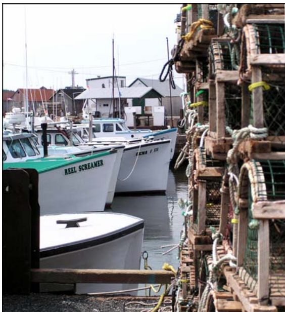
Ready for lobster season in North Lake Harbour

Well, there have certainly been changes, not all for the better. Around Charlottetown, the capital, growth has been phenomenal. Shopping malls have sprouted where potatoes grew. Many small stores in rural areas have closed. In the village where we once lived, there were two small groceries, and now there are none. Everyone drives to the big, new superstores. Of course we don't know to what degree the bridge is responsible. Such changes may have come anyway.